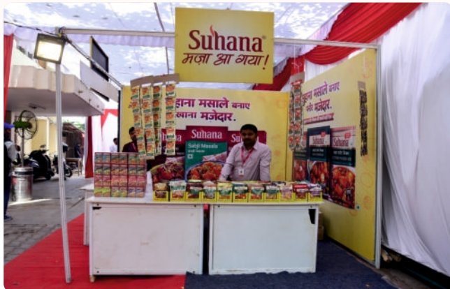
Suhana participated in Spices Conference Expo and put up their stall