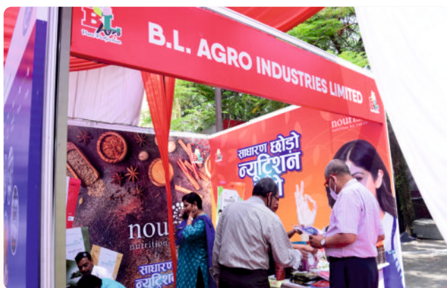
B.L Agro Industries Limited participated in Spices Conference and Expo and put up their stall.