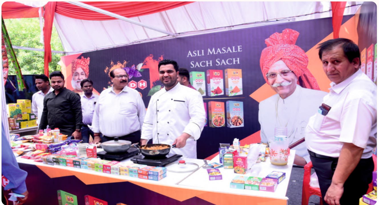
MDH participated in Spices Conference and Expo and put up their stall.

The following Spice Companies participated and had put up their stalls