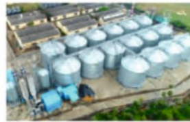
Flat & Hopper Bottom Silos