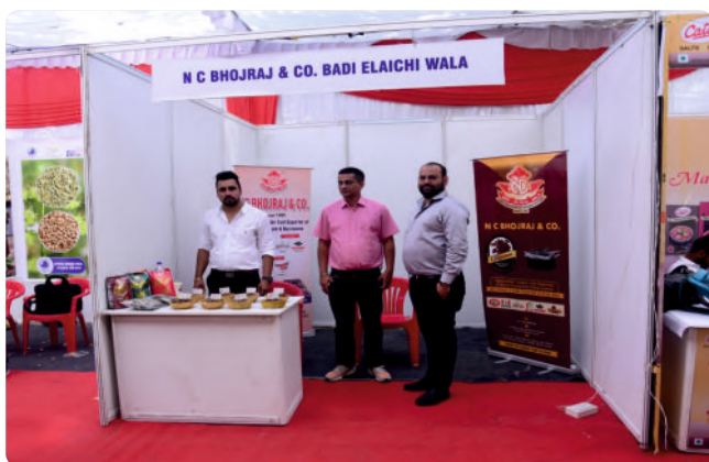
N C Bhojraj & Co. Badi Elaichi Wala participated in Spices Conference and Expo and put up their stall.