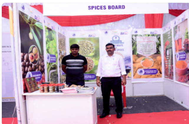
Spices Board participated in Spices Conference and Expo and put up their stall