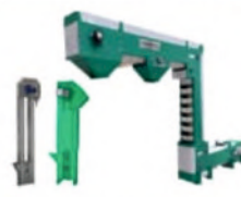
Material Handling Equip