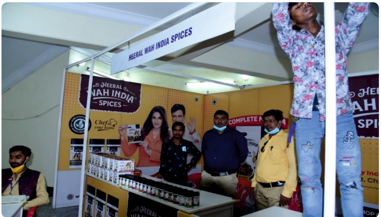
HEERAL WAH INDIA SPICES participated in Spices Conference and Expo and put up their stall