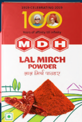
LAL MIRCH POWDER