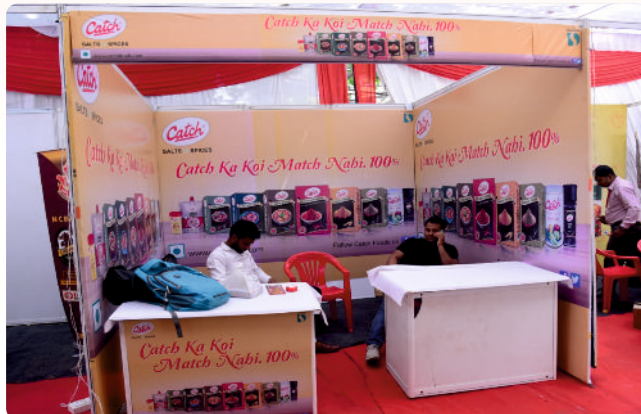
Catch participated in Spices Conference and Expo and put up their stall